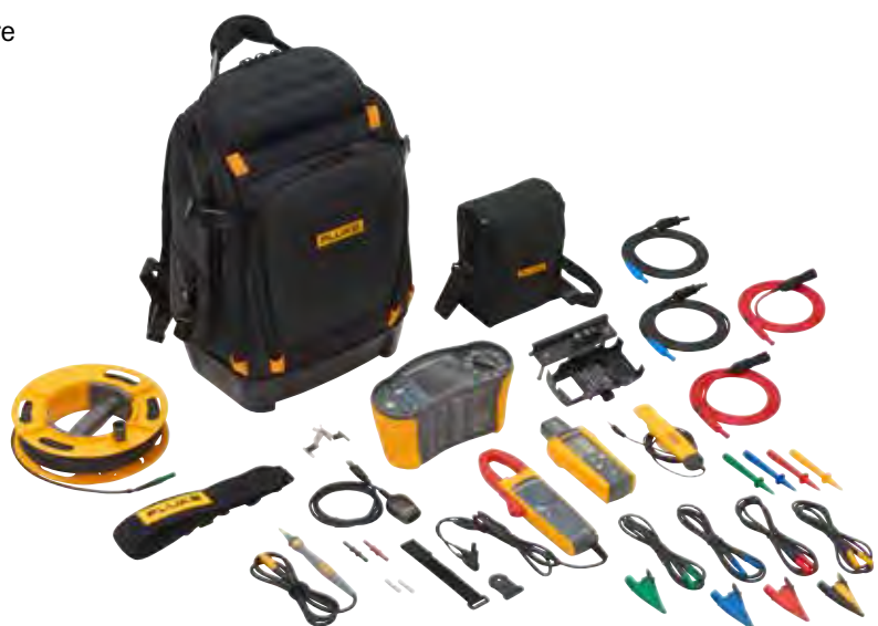
Fluke. Keeping your world up and running.