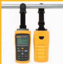
TPAK Magnetic Hanger