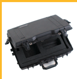
Probe and Readout Case