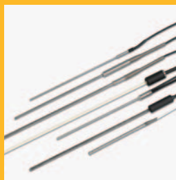
Calibrated Temperature Sensors

A wide array of accessories is available to help you maximize productivity, but the following are essential for most users.