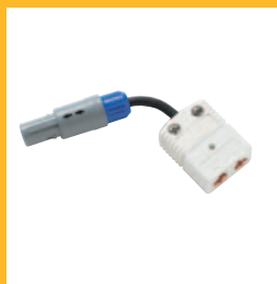
Universal Thermocouple Adapter