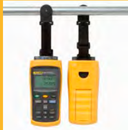
TPAK Meter Hanging Kit