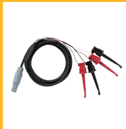
Universal RTD Adapter