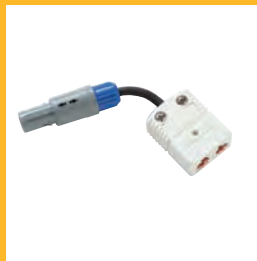
Universal Thermocouple Adapter