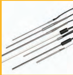
Calibrated Temperature Sensors

A wide array of accessories is available to help you maximize productivity, but the following are essential for most users.