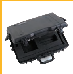
Probe and Readout Case