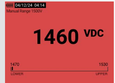
Limit gauge - outside of range