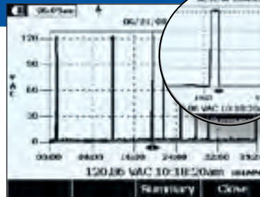
TrendCapture displays vDC logged date.