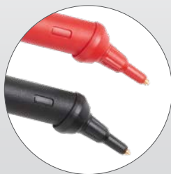
BTL20ANG Angled Measurement Probes