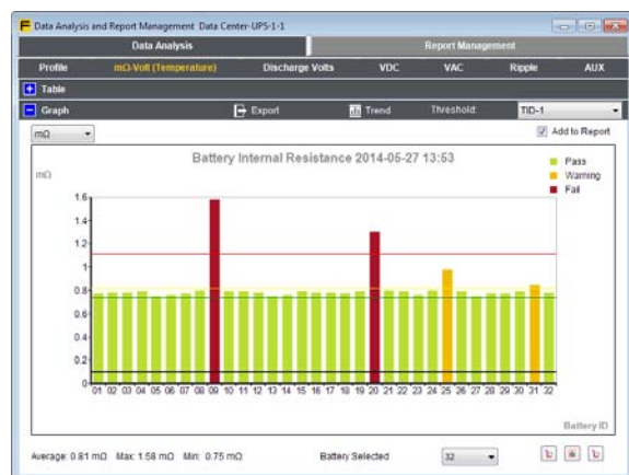
Histogram of a battery string with user defined threshold.