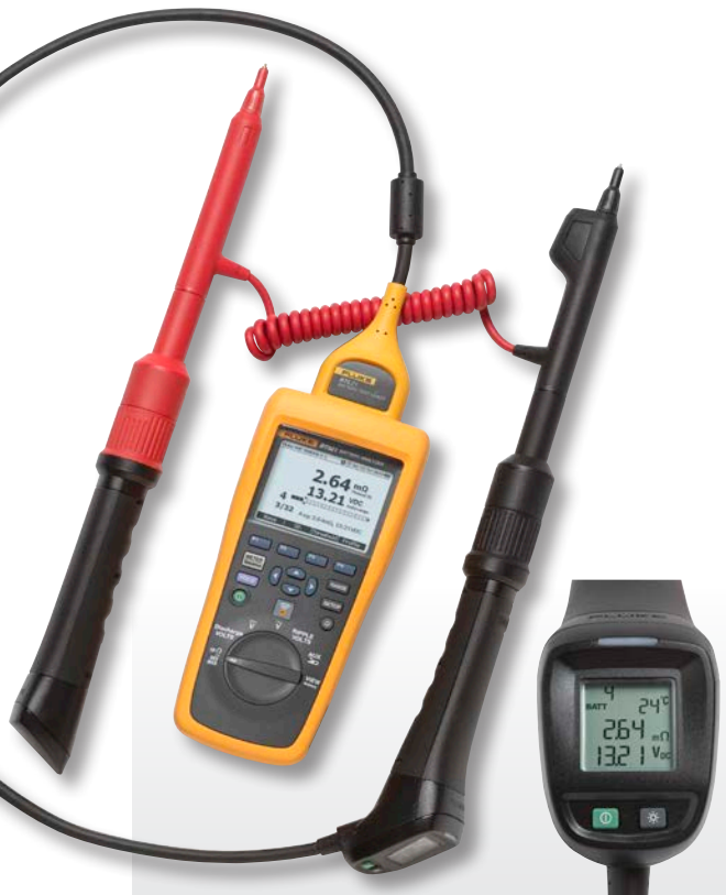
Intelligent test probe with integrated LCD display