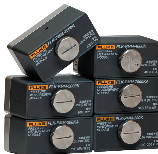
Figure 1. Rechargeable lithium battery with capacity indication.

HART communication enables mA output trim, trimmed to applied values, and pressure zero trimming of HART pressure transmitters. You can easily change a transmitter tag, measurement units and ranges. Other supported HART commands include setting fixed mA outputs for troubleshooting, reading device configuration parameters and reading device diagnostics.