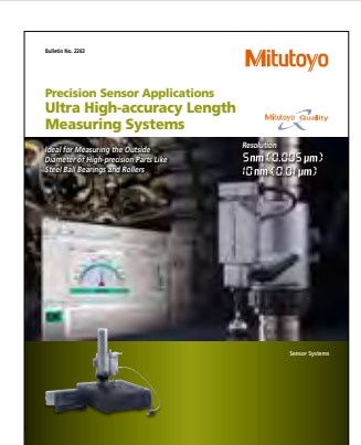
Refer to Bulletin No. (2263) for more details