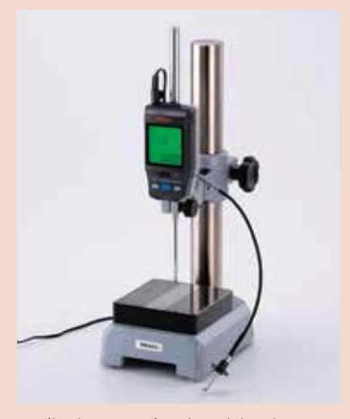
Application example using Digimatic Indicator ID-H.