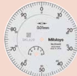
2044S 2044S-60 2044S-09