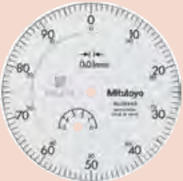
2044S 2044S-60 2044S-09