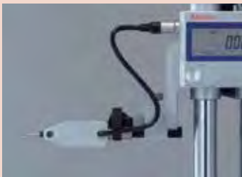
Shown with optional touch-signal probe

905338: SPC cable (40" / 1m) 905409: SPC cable (80" / 2m) 905691: SPC cable (L-shape, 40" / 1m) 905692: SPC cable (L-shape, 80" / 2m) 192-007: Bi-directional touch-signal probe (metric) 192-008: Bi-directional touch-signal probe (inch) 953638: Holding bar for test indicator (length: 50mm) 900209: Holding bar for test indicator (length: 100mm) 953639: Holding bar for test indicator (length: 2") 900306: Holding bar for test indicator (length: 4") 900321: Swivel clamp used with holding bar (metric) 900322: Swivel clamp used with holding bar (inch)